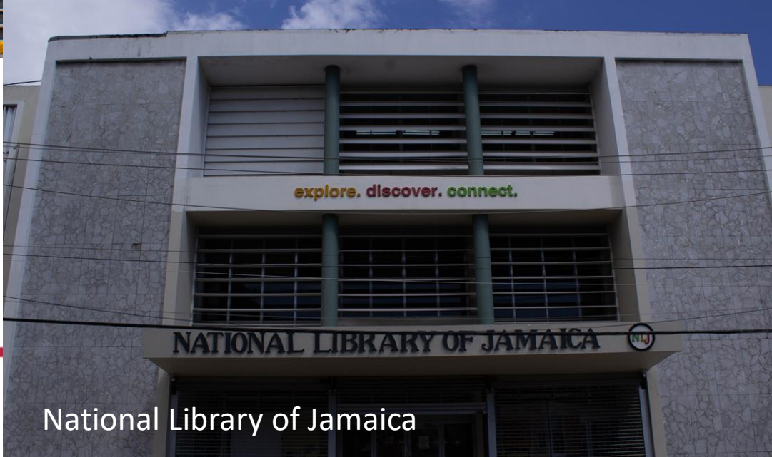
National Library of Jamaica