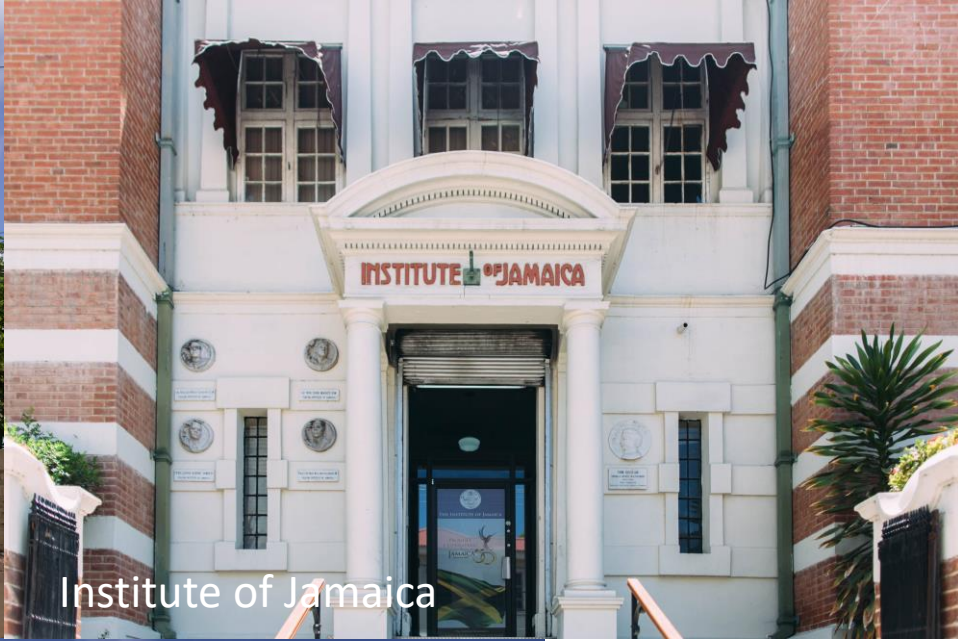
Institute of Jamaica